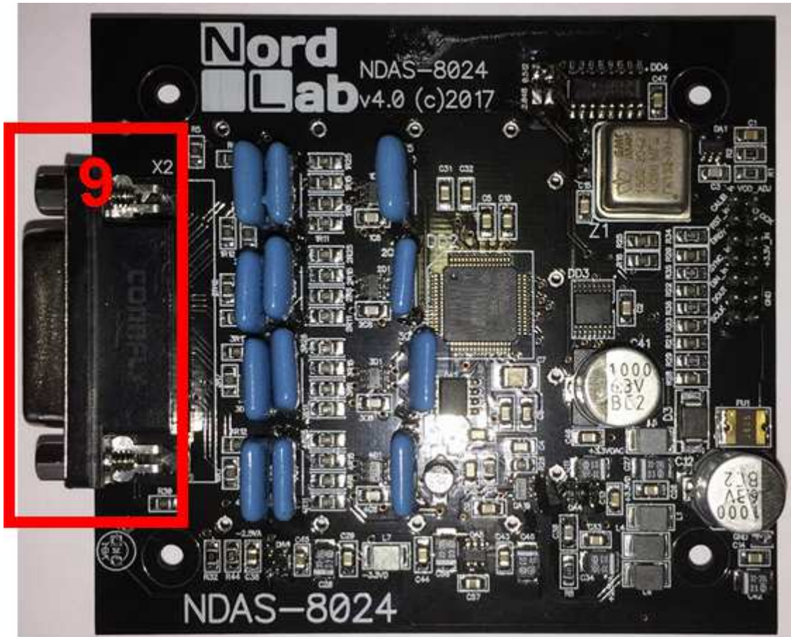
Fig.2. Bottom view, NDAS-8024 board.