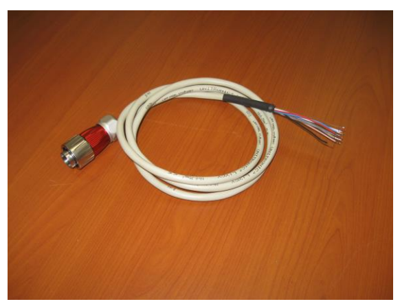
Fig. 2. Appearance of the seismometer cable.

Connector type: DH-20-J12PE-03-001 socket