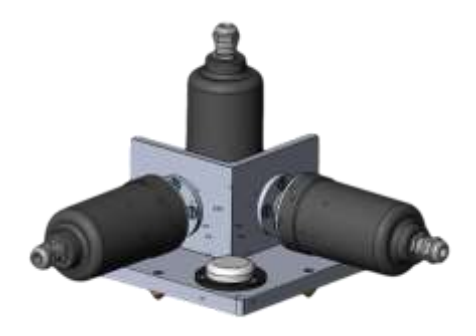
Three MTSS-1041A/MTSS-1031A sensors installed on a mounting base.

The wide dynamic range, lowest distortion, high temperature stability and competitive price make it ideal and cost-effective solution for various applications such as earthquake measurements or structure monitoring.