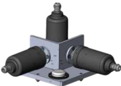
Three MTSS-1001 sensors installed on a mounting base.