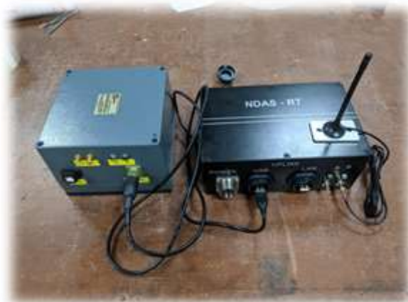
Fig. 1. Digital accelerometer MTSS-1033ND and multipurpose module NDAS-RT

Fig. 1 shows the appearance of instruments which can be used for the system. It is preferable to use the MTSS-1033ND or MTSS-1043ND digital accelerometers in combination with multipurpose modules for seismic monitoring systems.